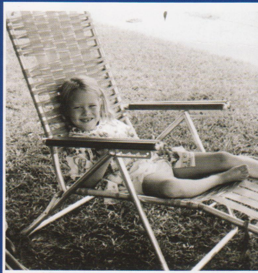
Lazy days at Fort Bragg, NC